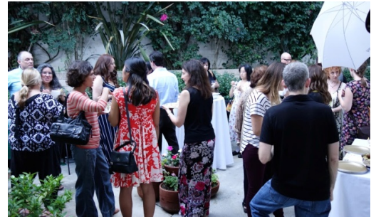
Figure 3 - S. California Chapter Meet & Greet

The Local Chapters will give you the possibility to exchange both professional experiences and services, such as reviewing each other’s papers and conference contributions. It will also act as a greenhouse for new ideas that can be implemented globally and provide TVF with potential new members of the Advisory Board.