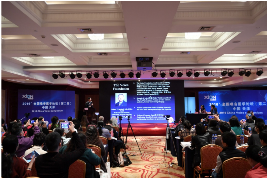
Figure 1 - The China Chapter