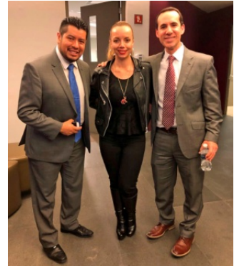
Figure 6: Mexico Chapter