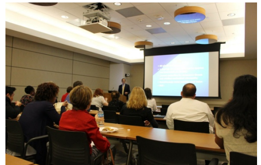
Figure 4 - Houston Area Chapter