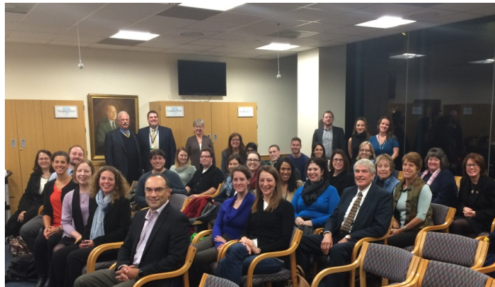
Figure 7 - The New England Chapter

Ideally, the group should consist of volunteers representing several disciplines and institutions. It allows you to share the workload and minimizes the risk of the effort failing because of a single key person was diverted from the task.