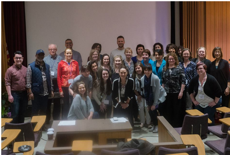
Figure 5 - The Chicago Chapter