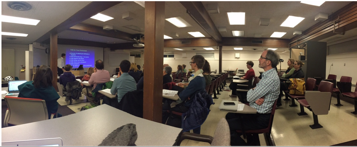
Figure 2 - The Seattle/Northwest Chapter