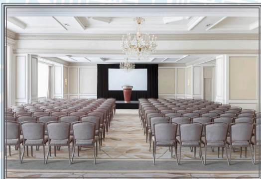
Exhibit Hall Highlights

Move-in 6:00am - 7:00am Show Hours 8:00am - 3:00pm Move-Out 3:00pm - 4:00pm