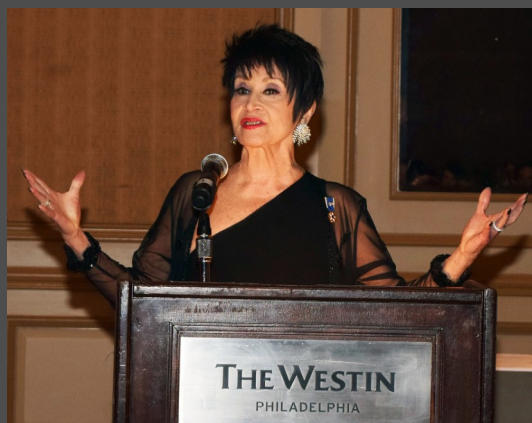
2016 *Chita Rivera