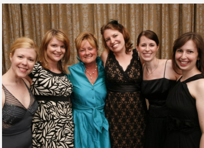
The lovely ladies of the Voice Foundation support staff

Proceeds from the sale of pictures are donated back to the Voice Foundation to support year-round programming.