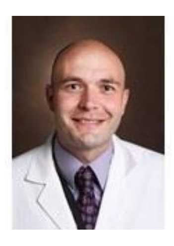
W D , W S Vanderbilt Voice Center Department of Otolaryngology Bill Wilkerson Center

Some practitioners also recommend steroids, decongestant nasal sprays, and other remedies when a patient has a vocal fold hemorrhage; but, the data and rationale for the prescriptions are less clear and therefore I do not recommend any other acute treatments. After a week of voice rest, videostroboscopy is repeated to evaluate the status of the affected vocal fold(s). Hemorrhages resolve analogously to bruises: red, purple, yellow then back to the pearly white normalcy of the vocal fold. If the hemorrhage has completely resolved, I will review the factors that led to its occurrence. In particular, I press them on the overuse issue. It is pragmatic to delay full return to performing for at least a couple weeks following a hemorrhage. Importantly, once resolved I will have them work with our speaking and/or singing voice specialist Speech-Language Pathologists to investigate and address maladaptive behaviors and to reiterate healthy behaviors. I usually do not hold them back from performing beyond a short hiatus, but do warn that in some circumstances hemorrhage can recur. Only if they experience recurrent hemorrhages is operative intervention discussed.